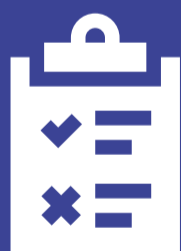
Standard 10 MONITORING, EVALUATION, AND LEARNING