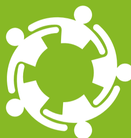
Standard 3 INCLUSION