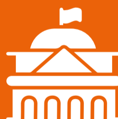
Standard 11 GOVERNMENT LEADERSHIP