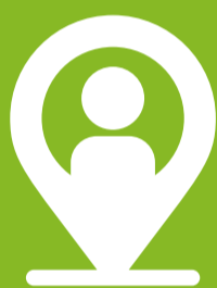
Standard 5 ADAPTABILITY AND LOCALIZATION