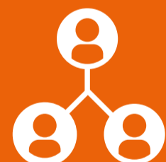
Standard 12 PARTNER COORDINATION