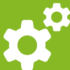
Standard 6 BUILDING ON LOCAL CAPACITY