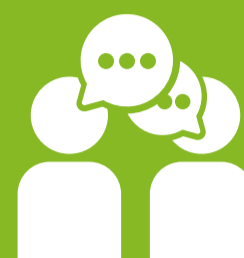
Standard 4 TWO-WAY COMMUNICATION