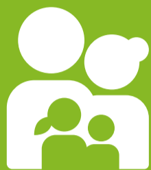
Standard 1 PARTICIPATION