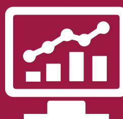
Standard 15 DATA MANAGEMENT