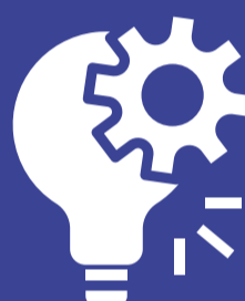
Standard 7 INFORMED DESIGN