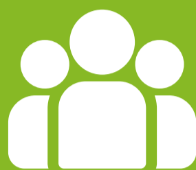
Standard 2 EMPOWERMENT AND OWNERSHIP