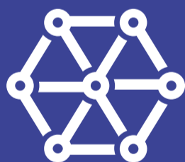
Standard 9 MANAGING ACTIVITIES