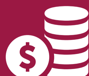
Standard 16 RESOURCE MOBILIZATION AND BUDGETING