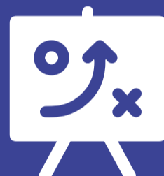
Standard 8 PLANNING AND PREPARATION