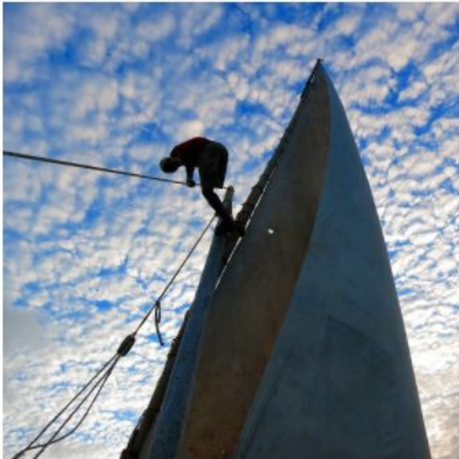
Chinese Overseas Finance